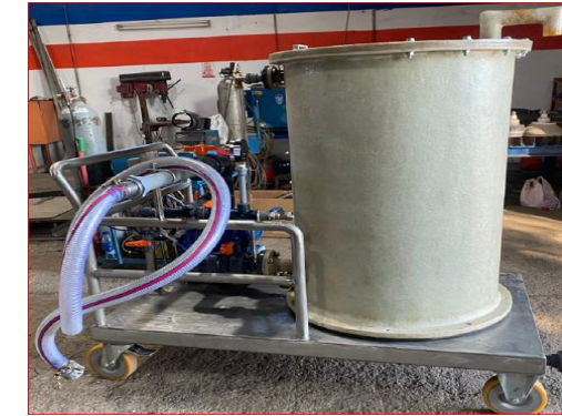
Hold Down Grids